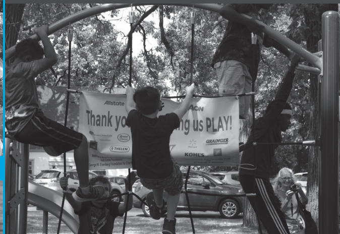
WE LOVE OUR NEW PLAYGROUND!