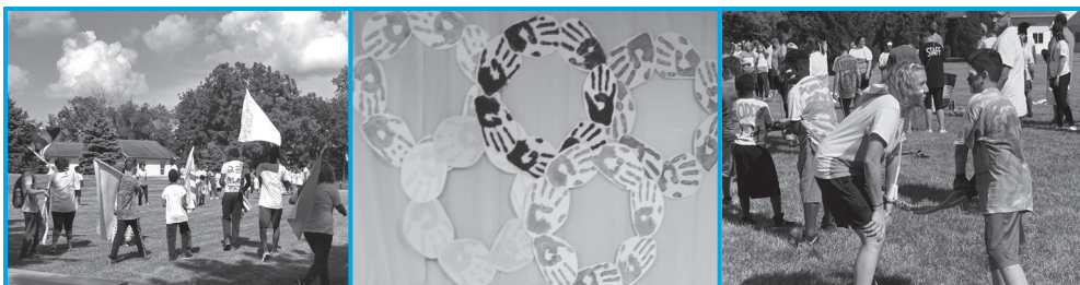
Great sportsmanship and fun at our annual Summer Olympics!

LET KIDS BE KIDS Recreational Therapy is Fun!