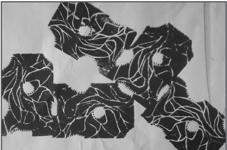
"SHARK BITE" -- Artwork by CQ, Allendale LINC-Woodstock Student