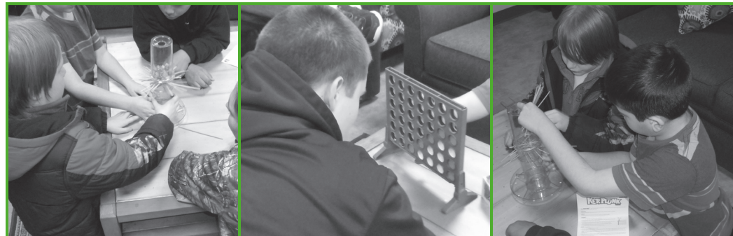
Inside Fun! Games...Games...and more Games!!!